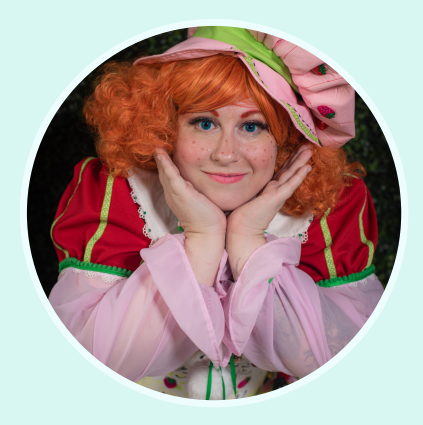
Please feel free to reach out for any questions.

Famoré Cutlery MakeCo Campus Mid Atlantic Puppetry Guild DesignGroup FanPowered Press